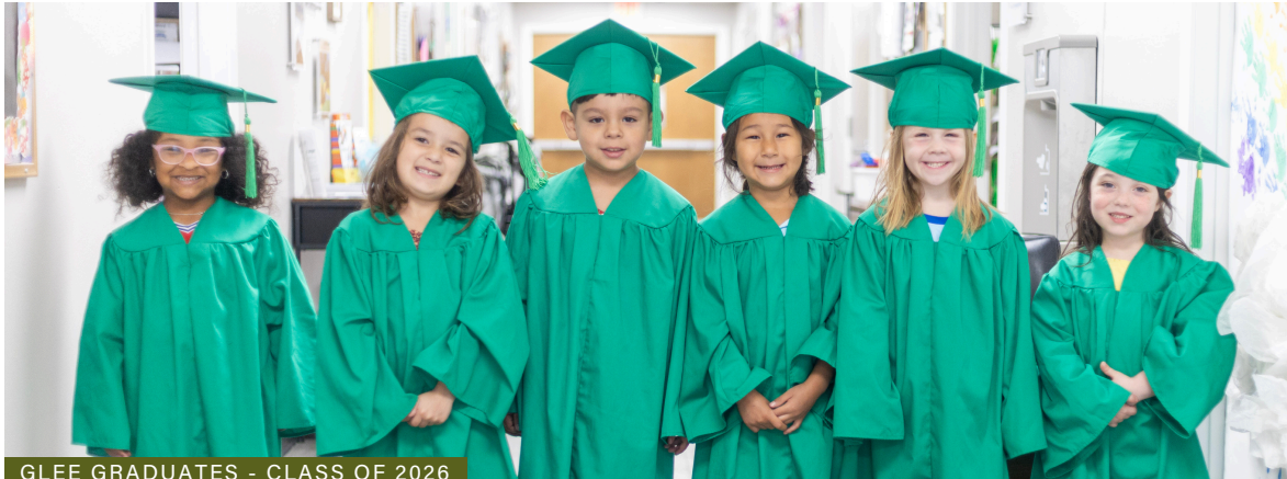
GLEE GRADUATES - CLASS OF 2026