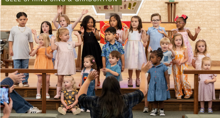
GLEE SPRING SING & GRADUATION